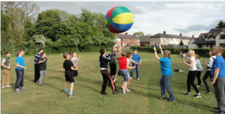
We have been able to share the Gospel with nearly 140 teens in Llay through our Fantastic Friday outreach. We see one or two new teens nearly every week!

And ye shall seek me, and find me, when ye shall search for me with all your heart.