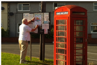
Putting up Holiday Bible Club poster on a community signboard in Llay. Please pray for fruit from this outreach!

Battlefield Baptist PO Box 279 Gainesville, VA 20156