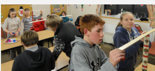
Fantastic Friday: Christmas Minute to Win It

I must work the works of him that sent me, while it is day: the night cometh, when no man can work.