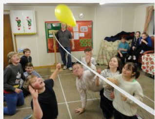
Fantastic Friday: Indoor balloon volleyball.