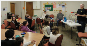
Fantastic Friday Message Time.

Battlefield Baptist PO Box 279 Gainesville, VA 20156